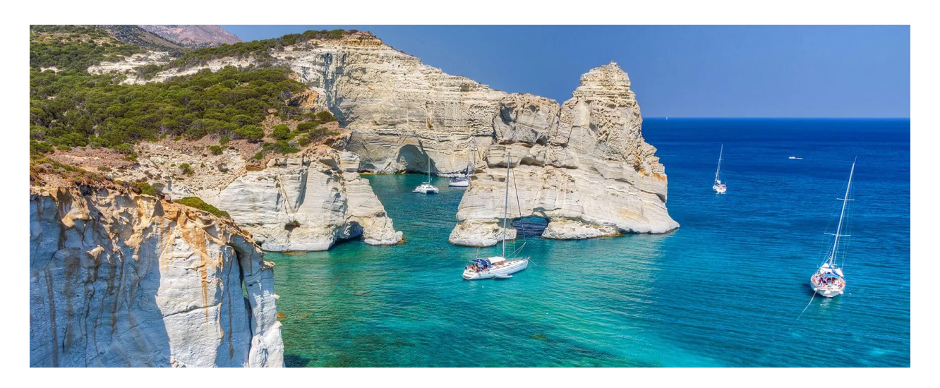
The whitewashed houses with ultramarine domes are typical of the Cyclades. Sail from the port of Lavrion to discover the wonders of these islands, including Kea, Syros, Paros, Sifnos, Kythnos, Mykonos, Santorini, Ios, Milos, and more!