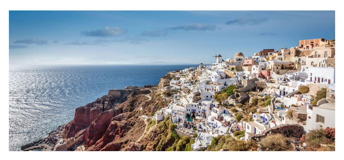
This famous archipelago in the Aegean Sea comprises some of the most beautiful islands in the world! Gorgeous sandy beaches, architecture in white and blue, traditional lifestyle, folk music, warm, hospitable people and barren landscapes with isolated chapels turn a trip to the Cyclades into a memorable adventure of a lifetime!